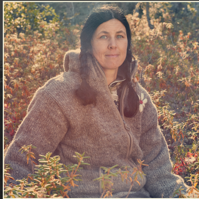
RAW & UNSCRIPTED