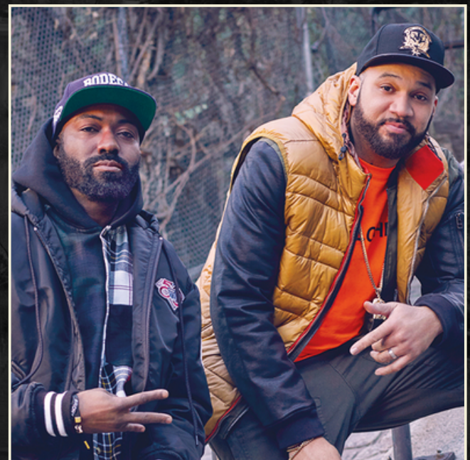
INFORMATIVE & ENTERTAINING